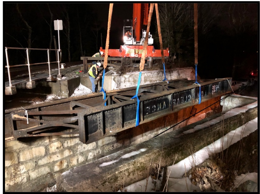
West St. Walpole Bridge Truss Removal