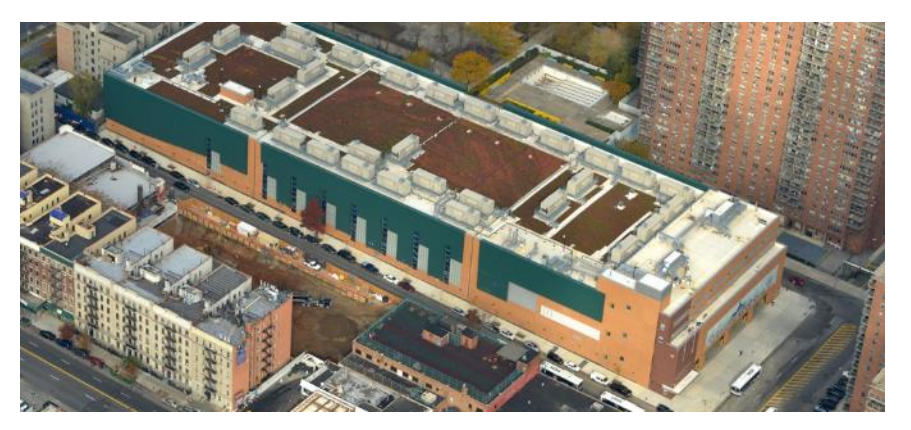
NY MTA Mother Clara Hale bus maintenance facility