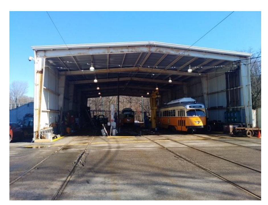
Mattapan car house, Boston