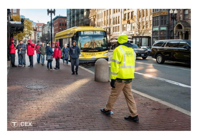
Preliminary Rapid Transit Diversion Service standards from 10/24/23 Board meeting