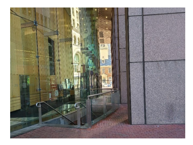
Washington Mall Entrance