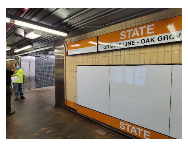
Washington Mall Platform