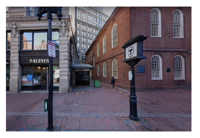
Milk Street Entrance