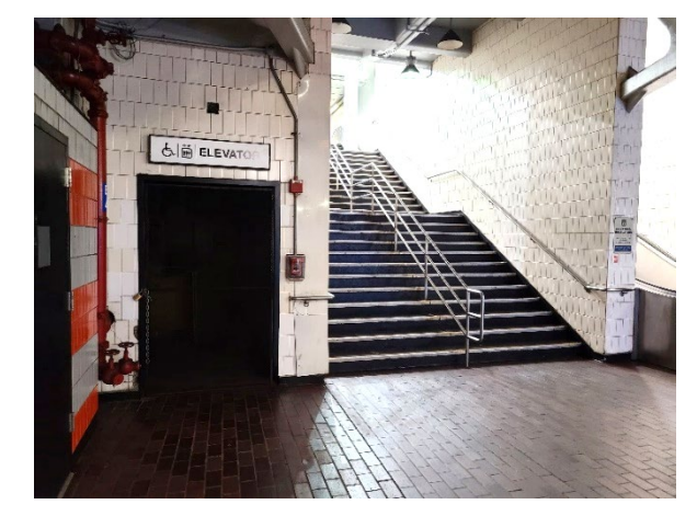
Old State House – Platform Lobby Elevator