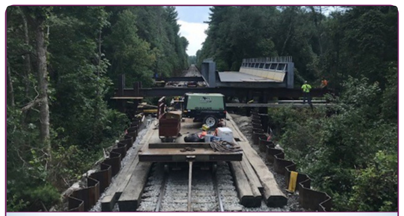
Assembling the Assonet River Bridge

Once over the track, the bridge was lowered onto two carts, each with four railroad axles. Each cart also carried a removable portion of the temporary beam that would be used to support the bridge and slide it sideways at its final location.