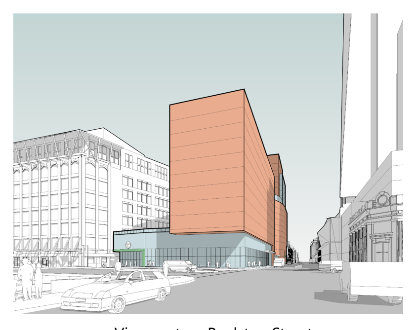
View east on Boylston Street